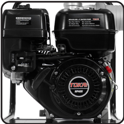
High Power with 5.8kW