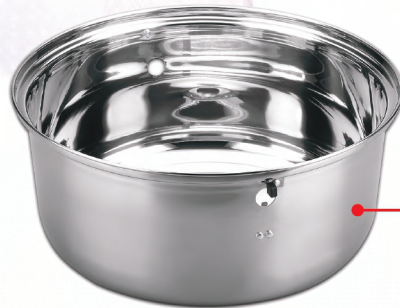
* Stainless Steel Bowl