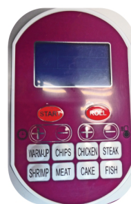
LCD SMART CONTROL