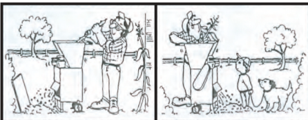
Use stick, never hands, if material bridges in hopper. Do keep people away and discharge shredder material into compost heap or fixed obstruction.