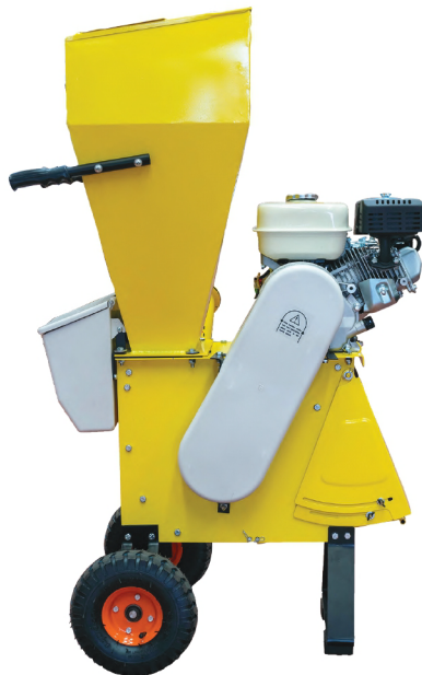
Don't allow pets, children or bystanders in operating area.